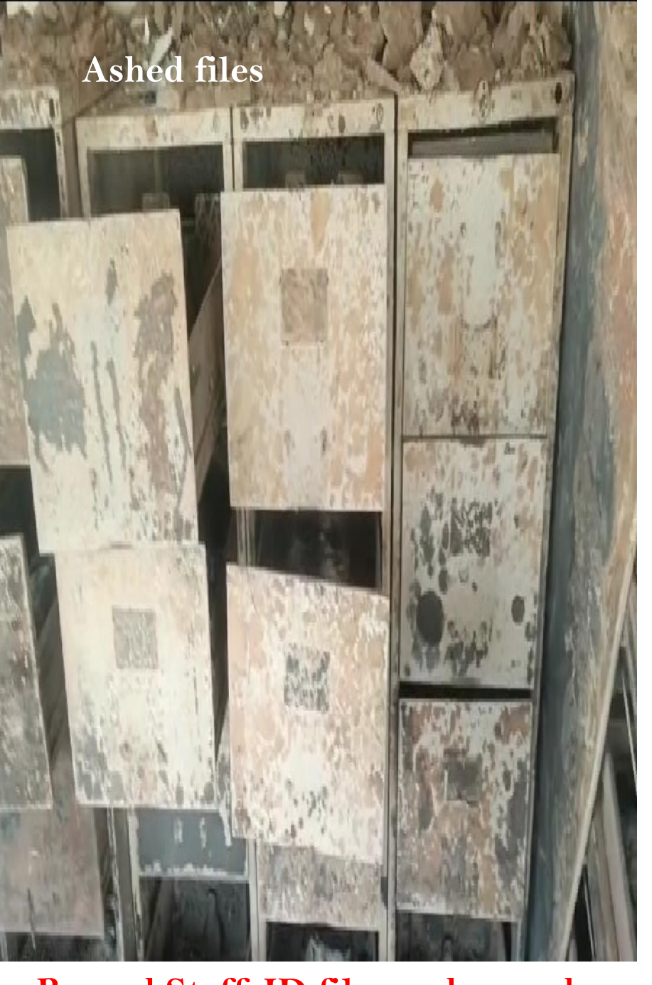
Burned Staff ID files and records