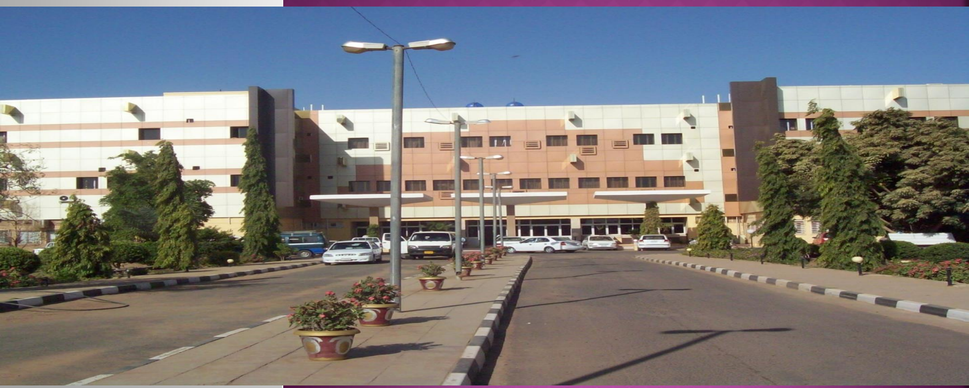
The 25th Meeting of COMSATS Coordinating Council, 10-12 September 2024, Tianjin, China