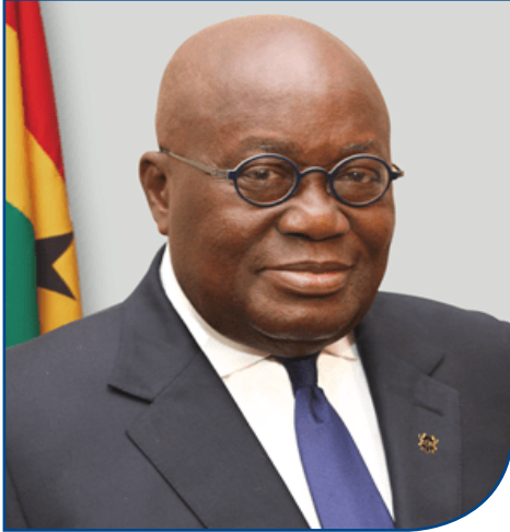
Hon. Nana Addo Dankwa Akufo-Addo President of Republic of Ghana Chairperson COMSATS