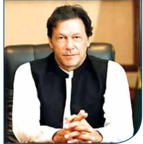
H.E. Mr. Imran Khan Prime Minister of Host Country, Pakistan