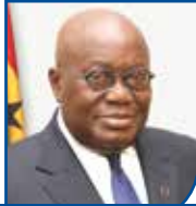
Hon. Nana Addo Dankwa Akufo-Addo President of Ghana & Chairperson COMSATS