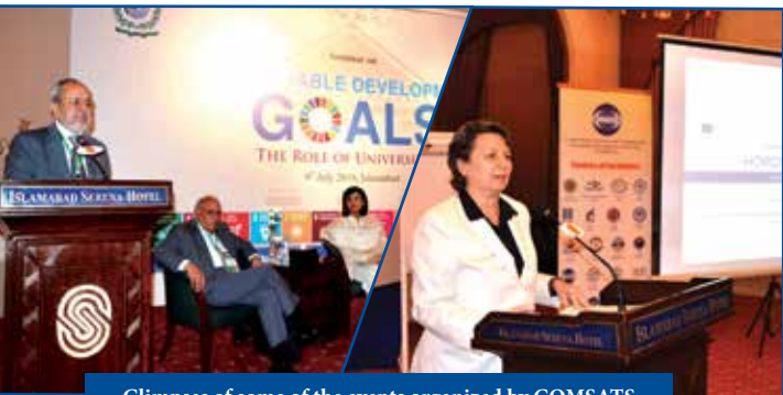
Glimpses of some of the events organized by COMSATS

The mission of COMSATS is 'to help create a world where all nations are at peace with one another and capable of providing a good quality of life to their populations in a sustainable way, using modern scientific and technological resources.'