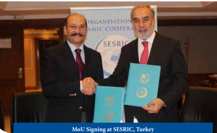
MoU Signing at SESRIC, Turkey