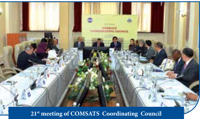
21 st meeting of COMSATS Coordinating Council

The Secretariat of COMSATS is permanently located in Islamabad and is being run through generous annual grant by the Government of Pakistan.