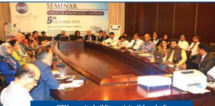
CTH capacity-building activity (Islamabad)

These and other projects of COMSATS are open to Member States for emulation. COMSATS has an open offer of training and consultancy to those Member States who are interested in similar institution-building.