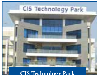
CIS Technology Park

general welfare by providing tele-health services for rural and remote areas in Pakistan. CIS' tele-health services are operational through a network of 13 Tele-Health clinics across Pakistan. Moreover, new grounds are being broken for expanding cooperation at provincial and federal