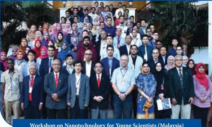
Workshop on Nanotechnology for Young Scientists (Malaysia)

direct relevance to the socio-economic needs of its Member States. These events are organized in collaboration with various international partner organizations and Centers of Excellence.