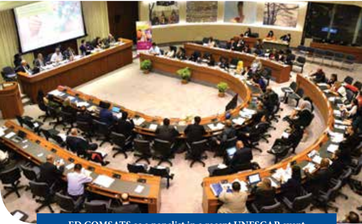
ED COMSATS as a panelist in a recent UNESCAP event

engaging with the Commission for achieving common objectives. Senior officials of COMSATS participated in the 74 th Session (May 2018) and Regional Consultation on South-South Cooperation (June 2018) held in Thailand.