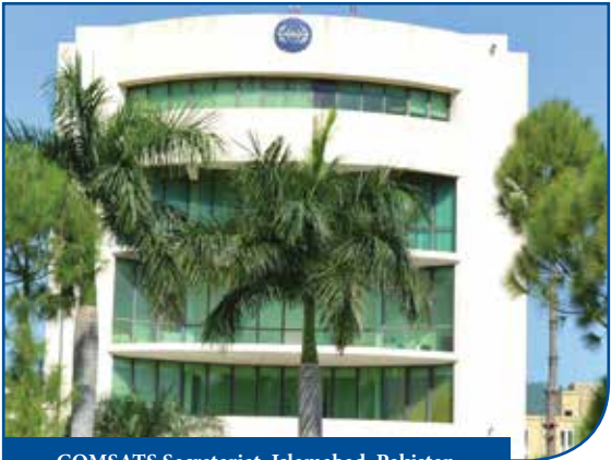
COMSATS Secretariat, Islamabad, Pakistan

The Commission on Science and Technology for Sustainable Development in the South (COMSATS) is an international intergovernmental organization of the developing countries with a mandate to help them jointly meet their developmental challenges through right application of S&T. An inter-governmental organization based in Islamabad, Pakistan, COMSATS was founded in 1994, as a result of a consensus reached by the nations participating in the organization's Foundation Meeting. At present, COMSATS has 27 Member States and a Network of 22 Science and Technology Centres of Excellence that facilitates pursuit of its mission of South-South cooperation.