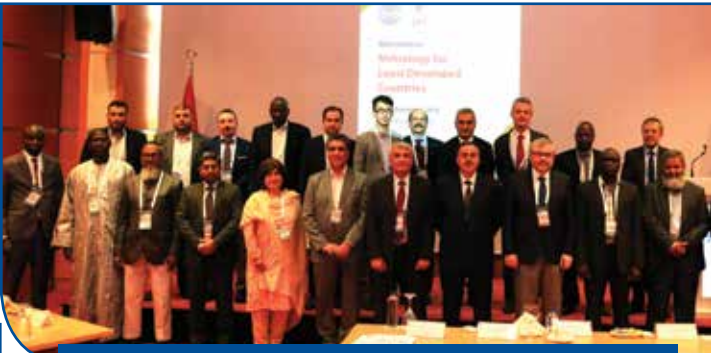
Participants of Workshop on Metrology for LDCs (Turkey)

COMSATS tries to create a necessary pool of human resources and facilitation for scientific infrastructure building for undertaking a variety of capacity-building programmes, bilateral and multilateral cooperative research, and consultancy/advocacy.