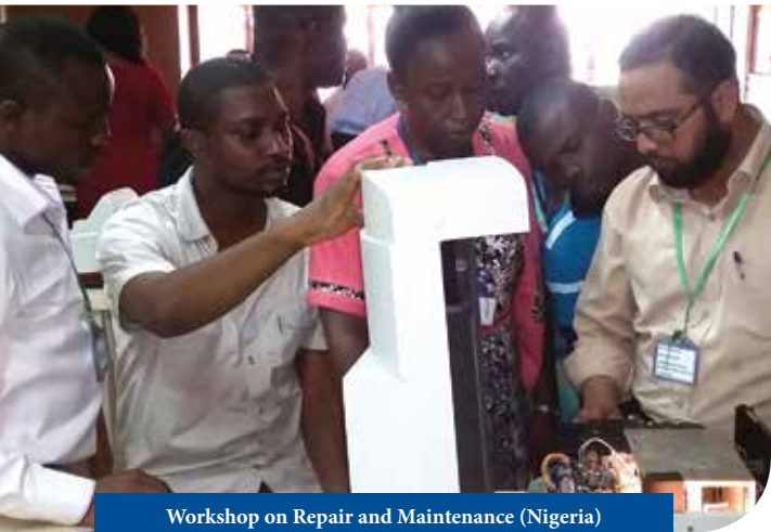
Workshop on Repair and Maintenance (Nigeria)