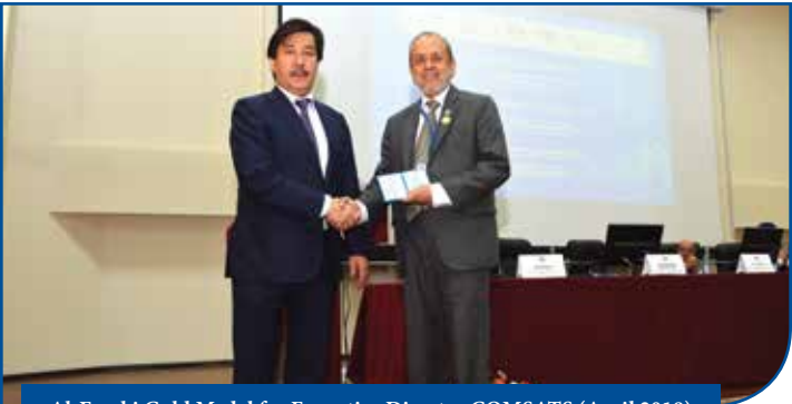
Al-Farabi Gold Medal for Executive Director COMSATS (April 2018)