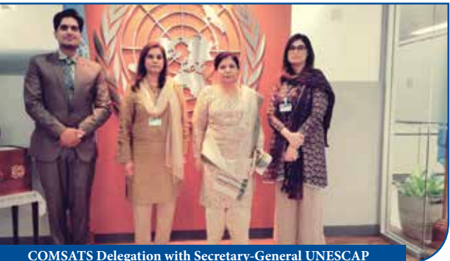
COMSATS Delegation with Secretary-General UNESCAP at 74 th UNESCAP Session (Thailand)

Having signed an MoU with the United Nations Economic Social Commission for Asia and the Pacific (UNESCAP) in 2017, COMSATS has been actively