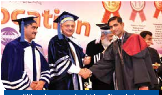
CUI continues to produce high quality graduates