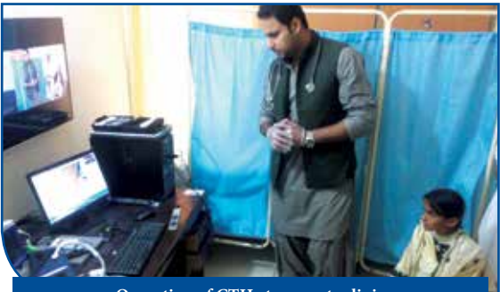
Operation of CTH at a remote clinic