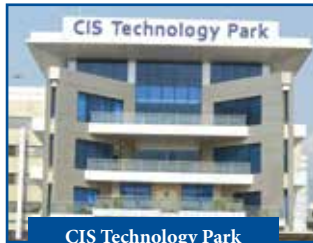
CIS Technology Park

COMSATS Internet Services (CIS): Started in 1996, CIS is the pioneer Internet Service Provider (ISP) of Pakistan. Currently, it is providing services to major cities of the country. CIS is a diversified ISP that offers Internet as well as data and cloud computing services to corporations, government and academic institutions. They also work for general welfare by providing tele-health services for rural