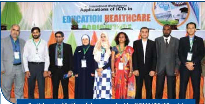
Participants of Int'l workshop organized by COMSATS (Nigeria)

COMSATS tries to create a necessary pool of human resources and facilitation for scientific infrastructure building for undertaking a variety of capacity-building programmes, bilateral and multilateral cooperative research, and consultancy/advocacy.