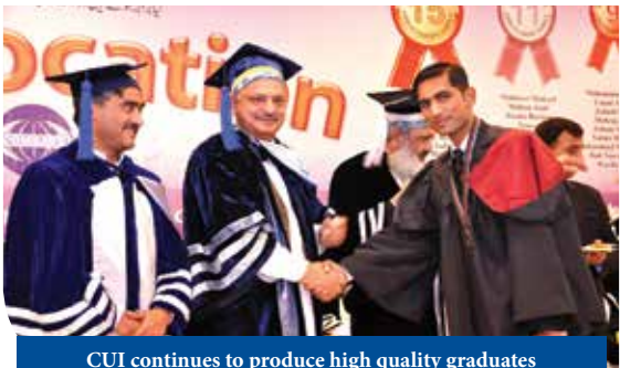
CUI continues to produce high quality graduates

Having been granted a structure of full fledged university, COMSATS Institute of Information Technology became COMSATS University Islamabad in 2018.