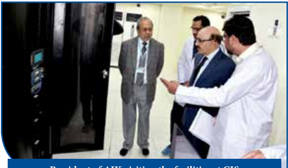
President of AJK visiting the facilities at CIS

and remote areas in Pakistan. CIS' tele-health services are operational through a network of 13 Tele-Health clinics across Pakistan. Moreover, new grounds are being broken