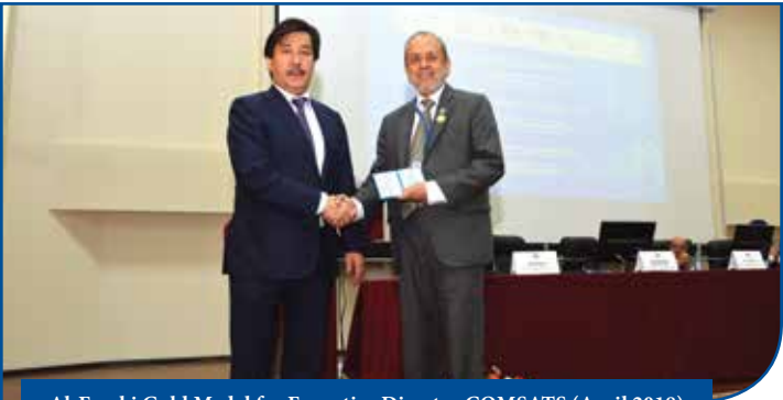
Al-Farabi Gold Medal for Executive Director COMSATS (April 2018)