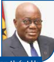
Hon. Nana Addo Dankwa Akufo-Addo Chairperson COMSATS