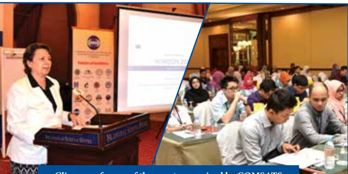
Glimpses of some of the events organized by COMSATS

The mission of COMSATS is 'to help create a world where all nations are at peace with one another and capable of providing a good quality of life to their populations in a sustainable way, using modern scientific and technological resources.'