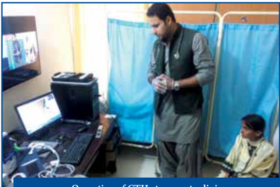
Operation of CTH at a remote clinic

These and other projects of COMSATS are open to Member States for emulation. COMSATS has an open offer of training and consultancy to those Member States who are interested in similar institution-building.