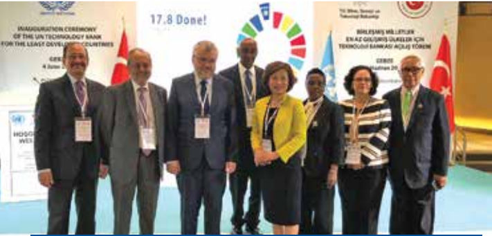
COMSATS at UN-OHRLLS Technology Bank for LDCs (Turkey)