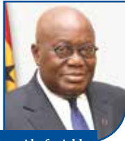
Hon. Nana Addo Dankwa Akufo-Addo Chairperson COMSATS

The organization's secretariat is permanently located in Islamabad and is being run through generous annual grant by the Government of Pakistan.