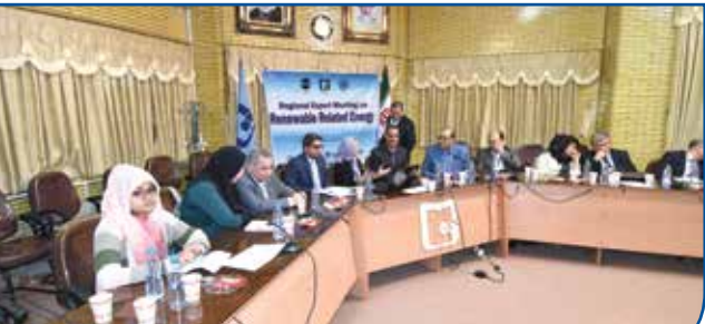
Foundation Meeting of ITRG on Renewable Energy, Zahedan, Iran

groups comprise of research scientists belonging to COMSATS' Member States and other developing countries. The six ITRGs have the following themes: (i) Information and Communication Technologies (led by CIIT-Pakistan); (ii) Agriculture, Food Security and Biotechnology (led by IRCC and University of Khartoum, Sudan); (iii) Natural Products Sciences (led by ICCBS-Pakistan); (iv) Climate Change and Environmental Protection (led by ICCES-China); (v) Mathematical Modeling (led by NMC-Nigeria); and (vi) Renewable Energy (led by IROST-Iran). Apart from serving as a platform for joint research projects, COMSATS' ITRG programme facilitates exchange of experts and sharing of laboratory resources among the member institutions. Moreover, opportunities of short-term trainings are provided to the group members in order to build their capacity in the target area and enable them to perform their research component