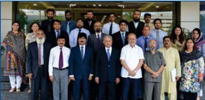
Officials of COMSATS Secretariat with Minister for S&T, Pakistan

COMSATS' ongoing quest for cooperative action has resulted in sixty (60) agreements with various partners.