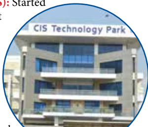
CIS Technology Park

Pakistan. CIS' tele-health services are operational through