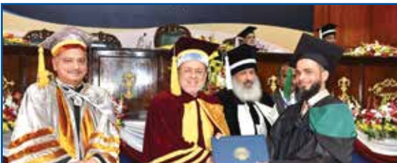
CIIT holds its centennial Convocation