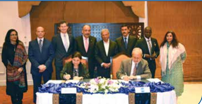
MoU Signing between UNESCAP and COMSATS

Under its new vision for future, COMSATS has stepped up its contacts with regional and international organizations. As a part of this exercise in 2017 COMSATS established its institutional arrangement with a regional development arm of the United Nations, UN Economic Social Commission for Asia and the Pacific (UNESCAP). The MoU signed with UNESCAP pertain to cooperation, inter alia, on joint research, events, capacity building, and STI Network of Centres of Excellence. The two Commissions are working to support member countries' efforts to exploit the potential of STI for sustainable development. Based on the decision that the two commissions would invite one another to attend their fora/meetings as observers, COMSATS was invited to attend 74 th session of UNESCAP.