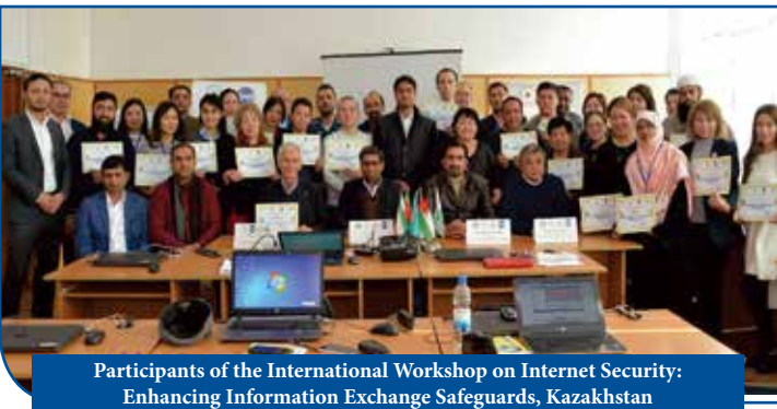
Participants of the International Workshop on Internet Security: Enhancing Information Exchange Safeguards, Kazakhstan