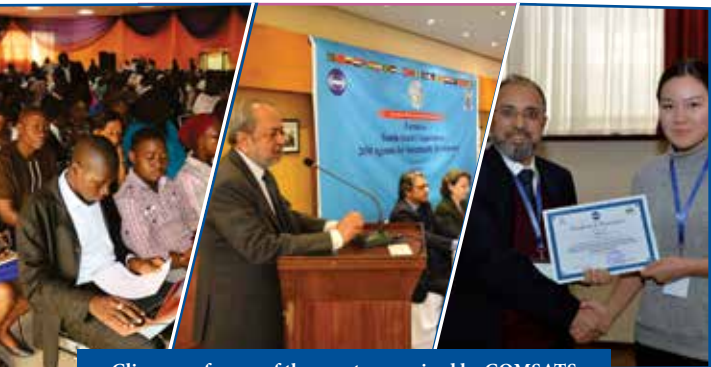
Glimpses of some of the events organized by COMSATS

The mission of COMSATS is 'to help create a world where all nations are at peace with one another and capable of providing a good quality of life to their populations in a sustainable way, using modern scientific and technological resources.'