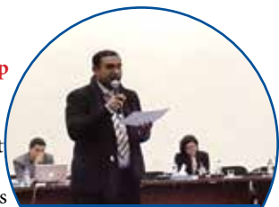
Technical Session of the International Workshop on Internet Security, Morocco

Distinguished Professorship Scheme aims to build capacity of R&D organizations and universities of Member States through lectures delivered by renowned scientists and professors. In this regard, the travel cost of the visiting professor is borne by COMSATS, while the host institutions provide facilities for boarding and lodging.