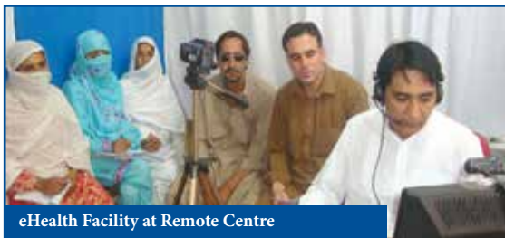
eHealth Facility at Remote Centre

These and other projects of COMSATS are open to Member States for emulation. COMSATS has an open offer of training and consultancy to those Member States who are interested in similar institution-building.