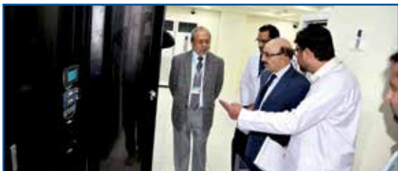
President of Azad Jammu and Kashmir visiting the facilities at COMSATS Technology Park with ED COMSATS