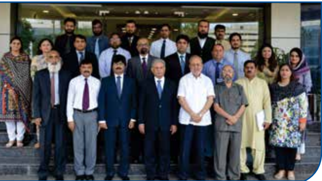
Officials of COMSATS Secretariat with Minister for S&T, Pakistan

The organization's top-most forum is its Commission that comprises Heads of the Member States that meet at the General Meetings. The statutory bodies of COMSATS are the ministerial-level Consultative Committee, a Coordinating Council comprising the heads of S&T Centers of Excellence, and a Technical Advisory Committee comprising of experts from the North and the South. The Coordinating Council along with the TAC and the Secretariat are the organs of COMSATS' Network.