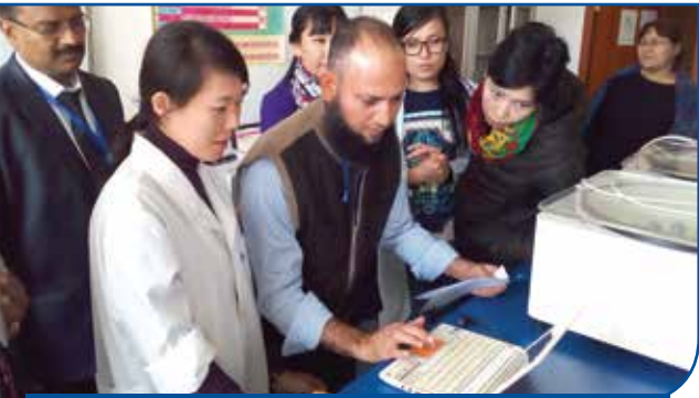
Training session of the Workshop on Repair and Maintenance of Scientific Equipment, Almaty, Kazakhstan