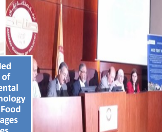
SwitchMed Transfer of Environmental Sound Technology (TEST) II in Food and Beverages industries