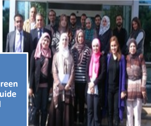
Jordanian Green Buildings Guide Manual

الجمعية العلمية الملكية Royal Scientific Society