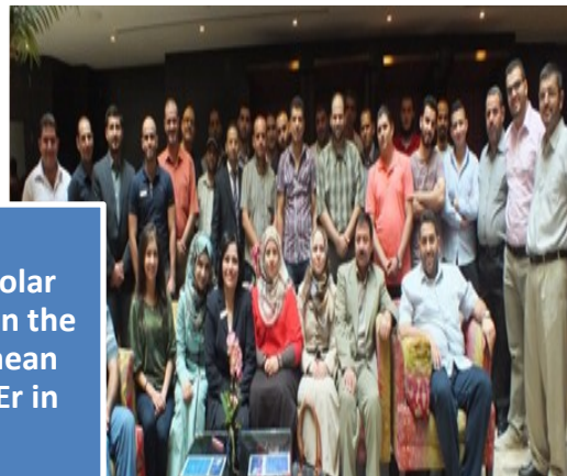
Fostering Solar Technology in the Mediterranean area (FOSTER in MED)