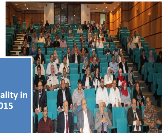
Software Quality in Jordan 2015