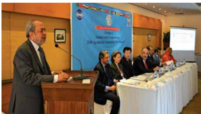
Executive Director COMSATS sharing his views at the Forum