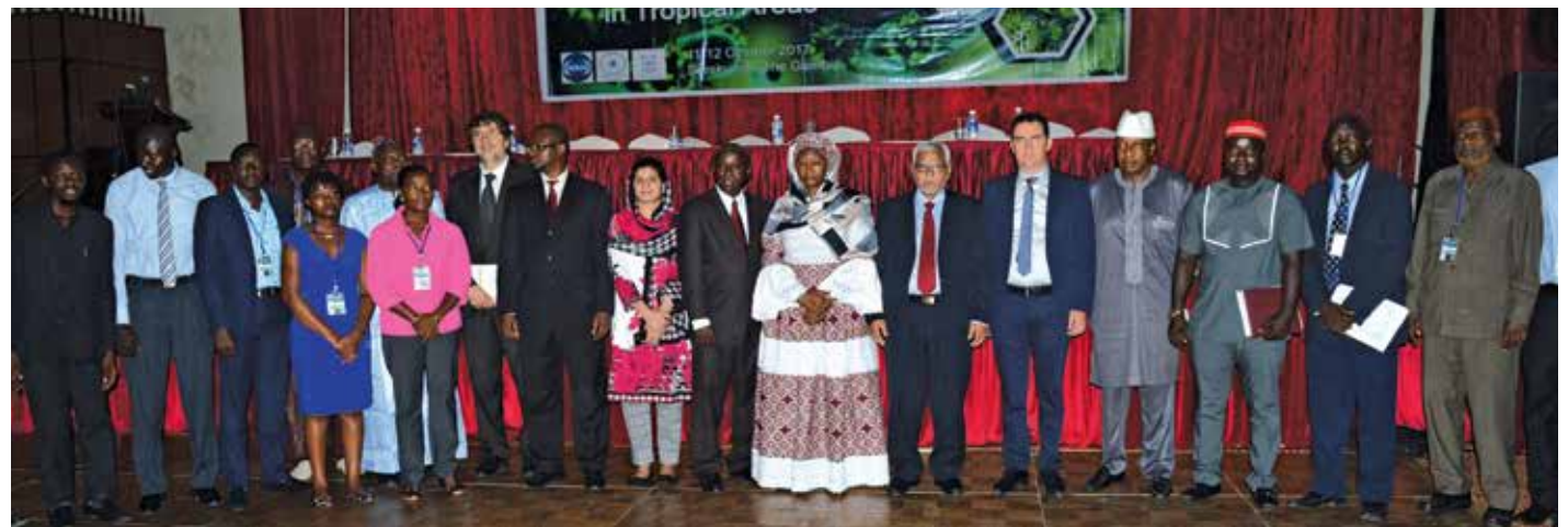
Distinguished Guests and Speakers at the Inaugural Session of International Congress on Viruses and Vaccines in Tropical Areas

Spectrophotometer Shimadzu UV 3600, Highly effective liquid chromatography (HELIC) SYCAM, Alloy analyzer (spectrometer) Agilent 725, ICP-MS Agilent 7500 USA, IR-Spectrometer Nicolet IR200, Mass Spectrometer/Chromatech-crystal 5000 and Auto Distillation Unit.