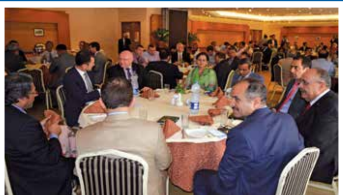
A Glance at the participants of the Event

The event had a strong attendance of over 110 from foreign missions in Islamabad, academia, R&D institutions and government representatives of Pakistan, as well as think tanks and international organizations and media. The representatives of foreign missions in Islamabad attending the forum belonged to Iran, Malaysia, Tunisia, Oman, Sudan, Kazakhstan, Turkey, China, Kenya, Uzbekistan, Tajikistan, Kyrgyz Republic, and Russia.