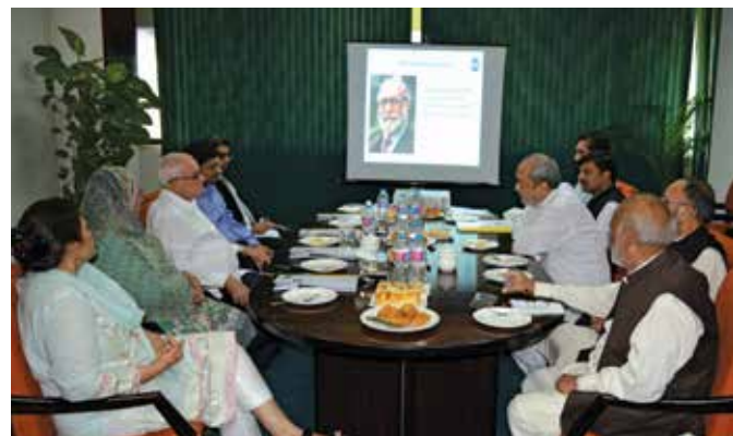
ED COMSATS giving a presentation to Ambassador of Cuba

thanked COMSATS for the offer of membership to Cuba, and pledged to follow-up the matter with the Cuban government in due course of time. He informed the participants about the recent initiatives taken by the Cuban government for strengthening S&T sector in the country.