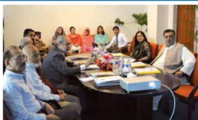
Minister of Science and Technology, Pakistan, and Secretary MoST, receiving a briefing from Executive Director COMSATS