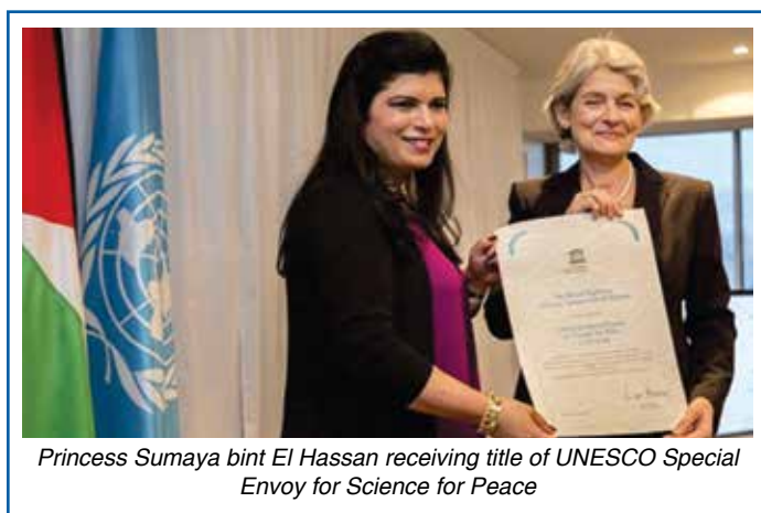
Princess Sumaya bint El Hassan receiving title of UNESCO Special Envoy for Science for Peace

As a UNESCO Special Envoy, the Princess will support the work of the Organization in science diplomacy, notably during the forthcoming World Science Forum, which will take place in Jordan from 7 to 11 November.