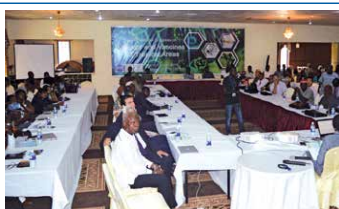
Participants of the Congress during Technical Session