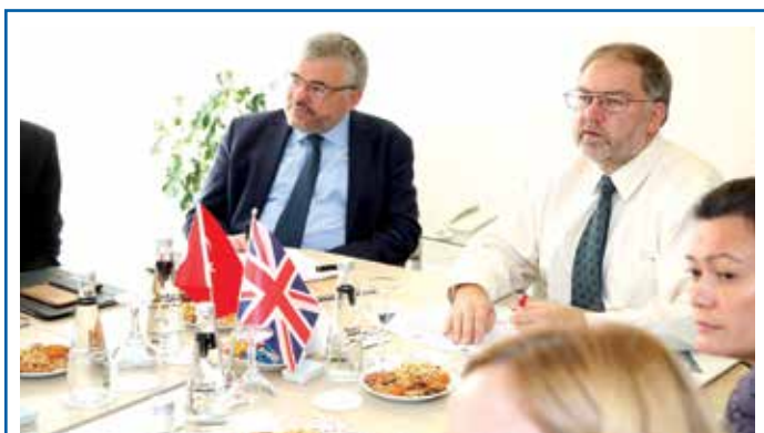
Consulate General of UK to Istanbul with the President of TUBITAK MAM