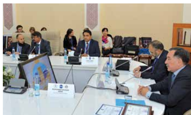
A technical session of the Kazakhstan workshop underway

A number of lab instruments repaired during the workshop.