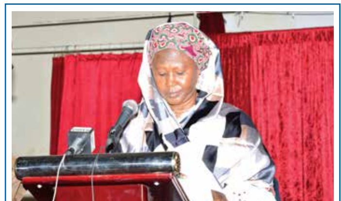
The Vice President of the Gambia Delivering Inaugural Address