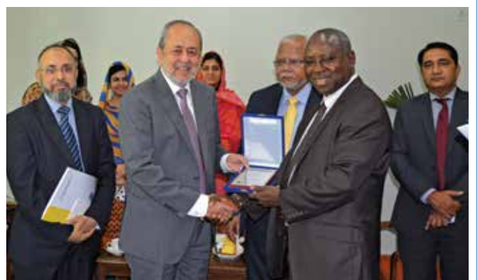
Permanent Secretary, MHERST, Gambia, receiving a shield from Executive Director COMSATS on his visit to the Secretariat