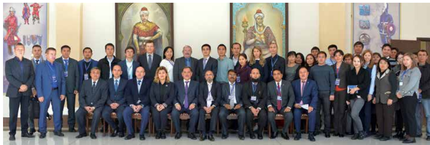
Participants of the Workshop on Repair and Maintenance of Scientific, Engineering Equipment in Universities, Research Institutions and Small Scale Industries, Almaty, Kazakhstan

biennium Cooperation Programme for 2016-2017. The event was hosted by Al Farabi Kazakh National University (KazNU), Republic of Kazakhstan, a COMSATS' Centre of Excellence in Kazakhstan.