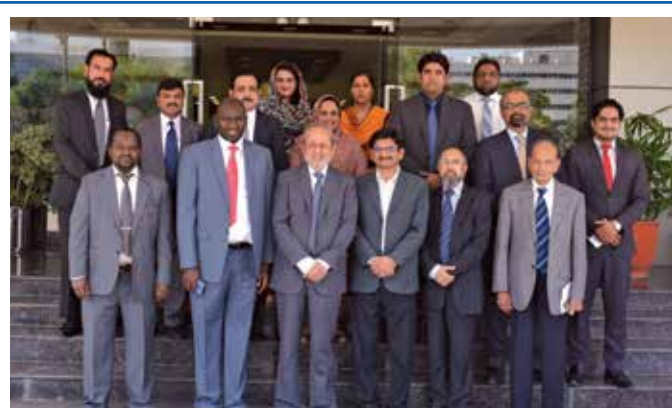
High Commissioner of Kenya with COMSATS' Officials

The High Commissioner called Kenya an engine of east and central Africa and showed interest in having it as a part of the Commission. He pledged to take up the matter with concerned departments in Nairobi for further consultation. The High Commissioner pledged his support for South-South cooperation.