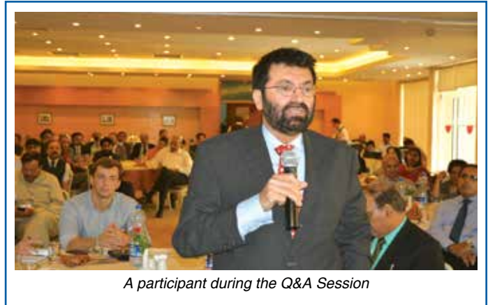
A participant during the Q&A Session