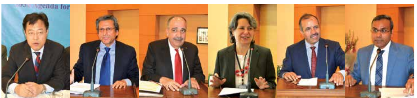
Speakers of the Forum on "2030 Agenda for Sustainable Development"