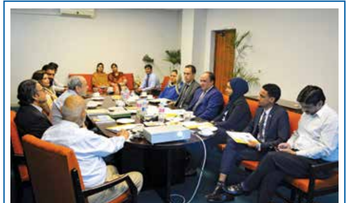
Ambassador of Tunisia and Somalia in a meeting with COMSATS' Officials

The Ambassador informed that Tunisia places special