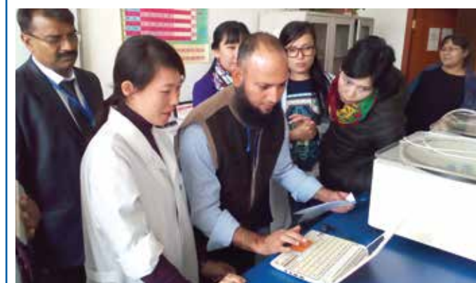
The participants of the workshop getting hands on training