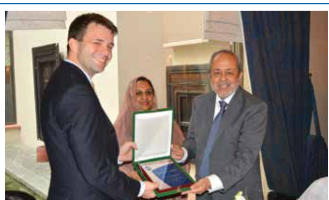
Executive Director COMSATS presenting a shield to the outgoing Ambassador of Bosnia and Herzegovina

For inclusion of Thailand as member state of COMSATS, a formal proposal of COMSATS' membership to Thailand was presented during meeting with Director (Office of International Cooperation), Ministry of Science and Technology, Bangkok.